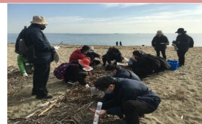
Training Program in Japan: Coastal Microplastics Survey