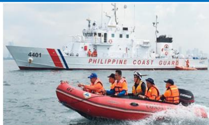
Philippines : Training using 44- meter-class patrol vessels provided by Japan