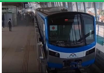
Viet Nam: Ho Chi Minh City Urban Railway