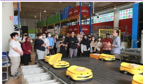
JSPP21 : Supply Chain Resilience course