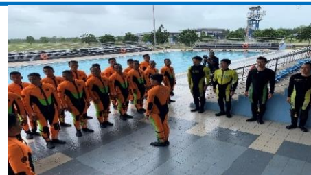
Malaysia: Training for Maritime Law Enforcement Agency (MMEA)