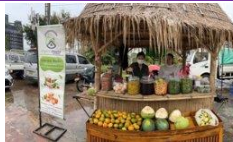
Laos: Organic vegetable juice stand started through a prior project