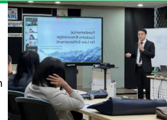
Thailand:Project for Enhancing the Human Resource Development Ca pacity of Customs Administration