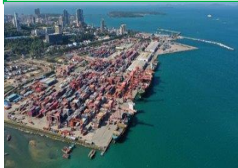
Cambodia: Sihanoukville Port