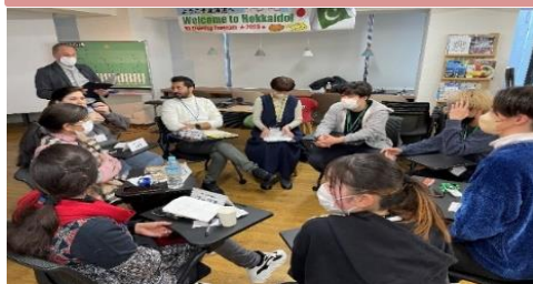
KCCP for Young Leaders: DX Practical Course by ICT Promotion

The project supports the development of advanced global engineering human resources and research activities in ASEAN countries, where the industrial structure and corporate activities are becoming more sophisticated. The project establishes an ASEAN-Japan inter-university network to train faculty members and conduct joint research.