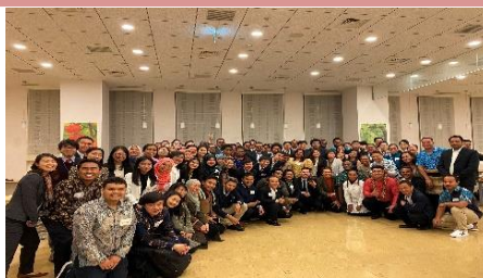
Participants in the SDG Global Leaders