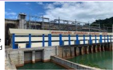
Laos: Expanded Nam Ngum 1 Hydropower Station