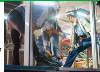
Indonesia: Construction of Jakarta MRT